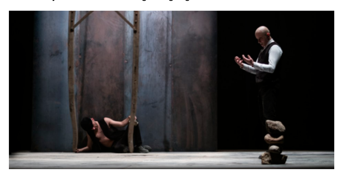
By Holly Taylor-Zuntz

When I read about Sardegna Teatret's production of Macbeth, I wasn't expecting to enjoy it. Firstly, it's Shakespeare (not always my vibe), secondly it's in a foreign language, and thirdly with an all male cast. None of these things were exciting my personal tastes, especially as it's the third show of this week's Gift Festival in a language I don't understand. But yet again, I was pleasantly surprised. This festival is teaching me the power of sitting back, letting go, and basking in the uncertainty of theatre in a foreign language.